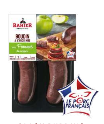
BLACK PUDDING WITH APPLES PASTEURIZED 2x125g