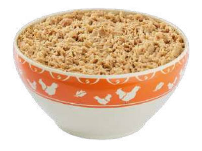
ROASTED CHICKEN RILLETTES l 1kg