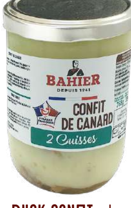
DUCK CONFIT 765g