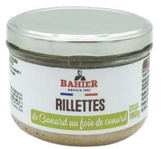
100% DUCK WITH FOIE GRAS RILLETTES