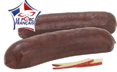
BLACK PUDDING WITH APPLES 8x125g