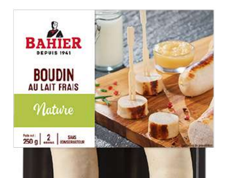
WHITE PUDDING PLAIN PASTEURIZED 2x125g