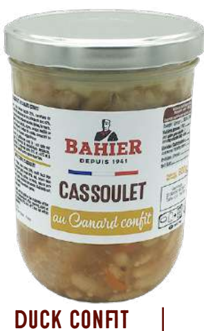
DUCK CONFIT CASSOULET 800g