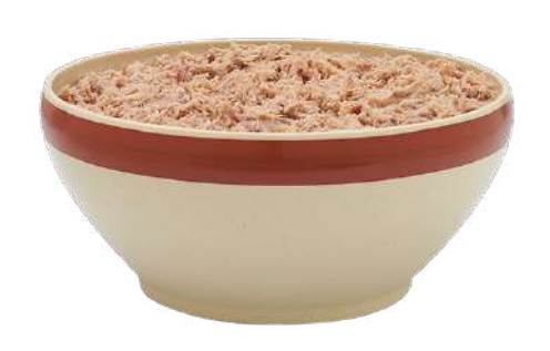
DUCK RILLETTES 2kg