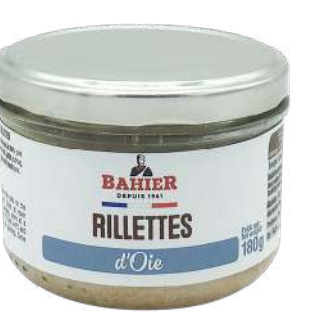
GOOSE RILLETTES 180g