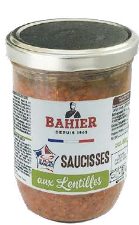
SAUSAGES AND LENTILS 800g