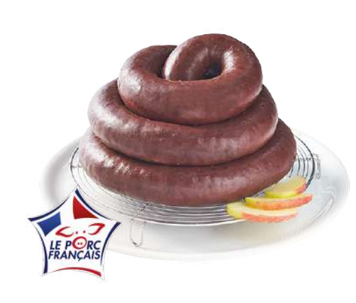
BLACK PUDDING WITH APPLES 1,5kg approx.