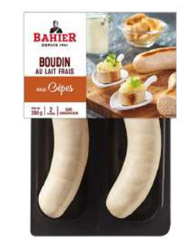
WHITE PUDDING WITH BOLETUS MUSHROOM PASTEURIZED