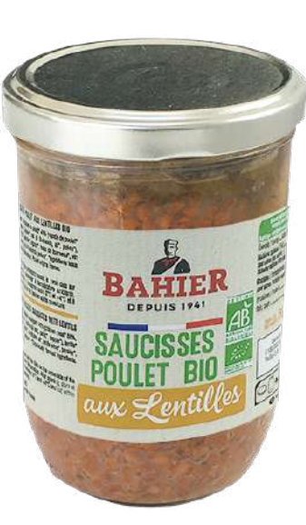
ORGANIC CHICKEN SAUSAGES WITH LENTILS 600g