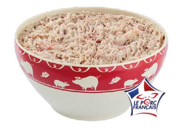
RILLETTES FROM LE MANS 1kg