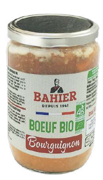
ORGANIC BEEF BOURGUIGNON 600g