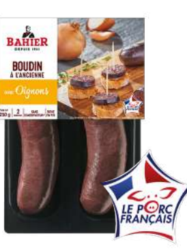
BLACK PUDDING WITH ONIONS PASTEURIZED 2x125g