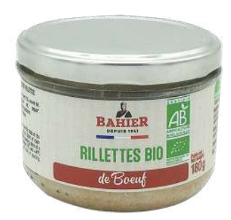
ORGANIC BEEF RILLETTES 180g