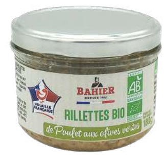
ORGANIC CHICKEN RILLETTES WITH GREEN OLIVES