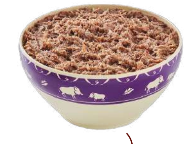
WILD BOAR RILLETTES